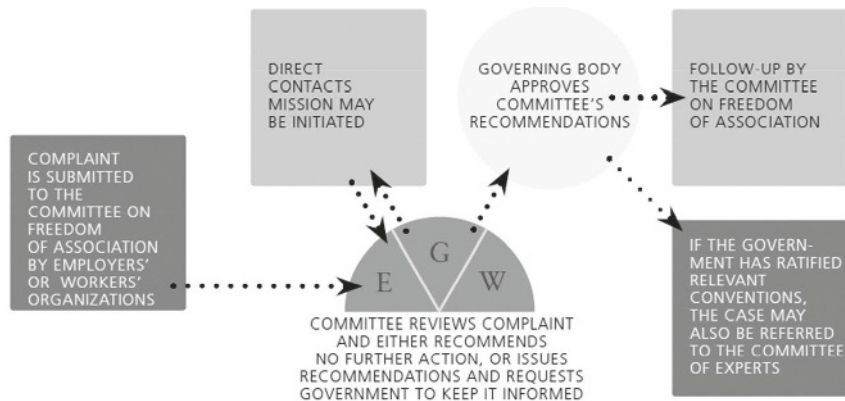
Figure 4. The freedom of association procedure 44

34. Under article 19 of the Constitution, member States are required to report at regular intervals, at the request of the Governing Body, on the position of its law and practice with regard to the extent to which effect is given, or proposed to be given, to any of the provisions of unratified Conventions. The goal of this obligation is to keep track of developments in all countries, whether or not they have ratified Conventions. Article 19 is the basis for the annual in-depth General Survey by the CEACR. These Surveys – on a subject chosen by the Governing Body – are established mainly on the basis of information and reports received from member States, and employers’ and workers’ organizations. Furthermore,